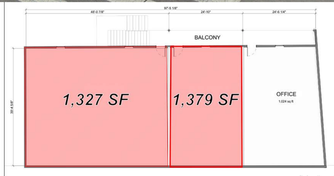
2 ENLARGED PLAN: 2ND FLOOR SCALE: 1/8" = 1'-0" 0 4 8 16